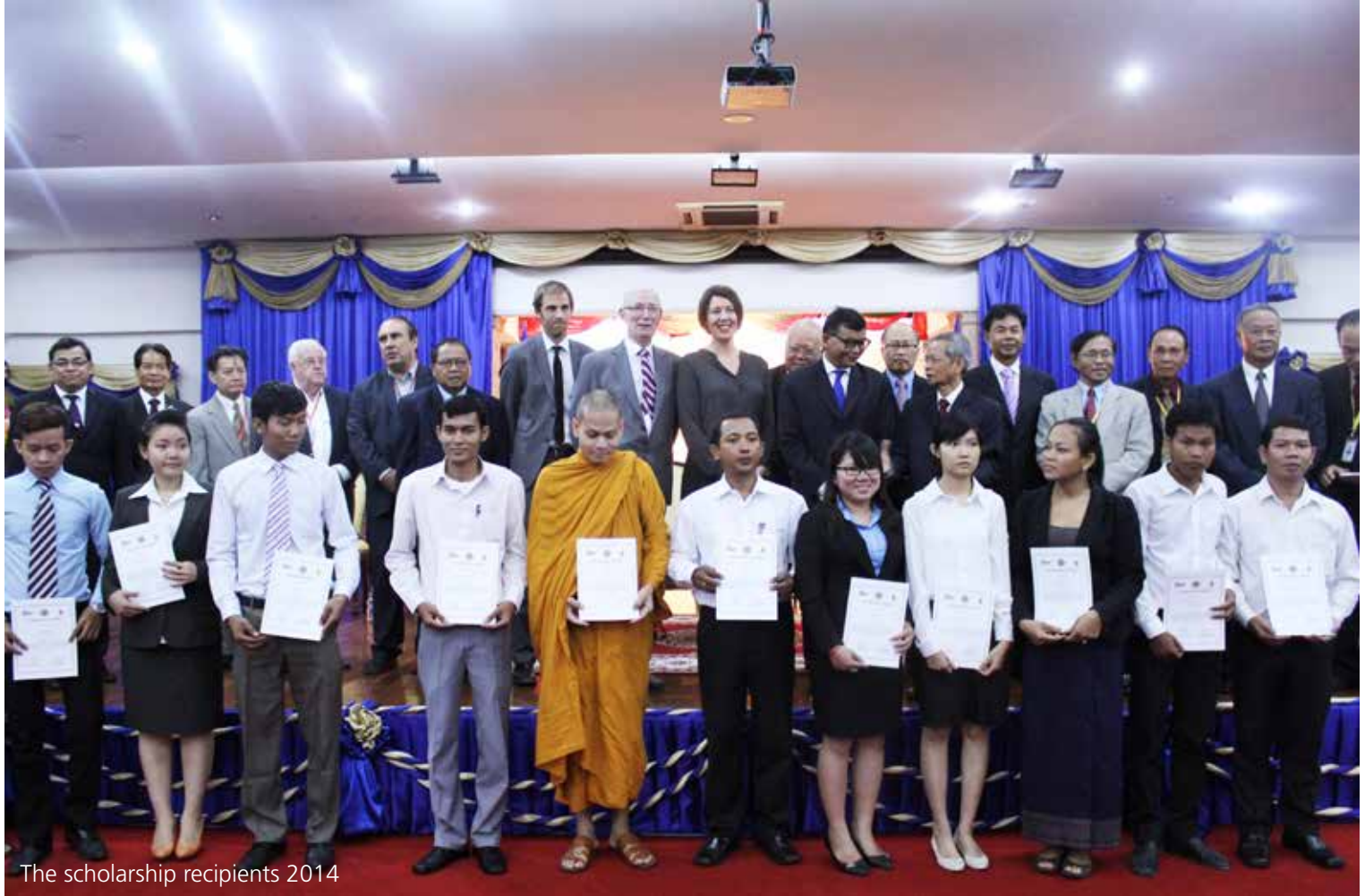
The scholarship recipients 2014