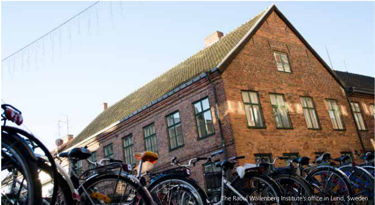
The Raoul Wallenberg Institute's office in Lund, Sweden

Since 2013 the Institute implements a large five-year human rights capacity development programme in Cambodia financed by Swedish Development Cooperation.